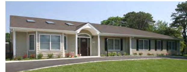
Atlantic House Children's Residence pictured below