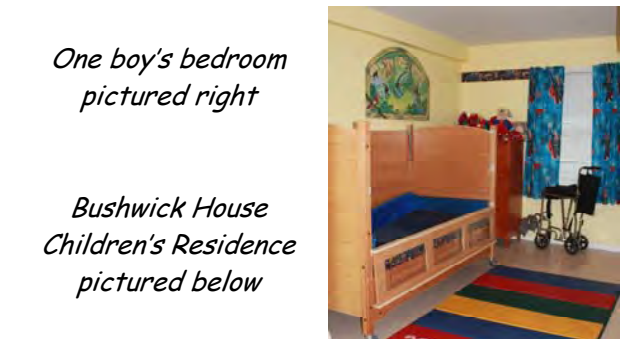
One boy's bedroom pictured right