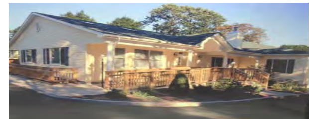
Bushwick House Children's Residence pictured below